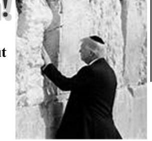
Pres. Trump at the Western Wall

victorious, it must sue for peace. Everyone expects the Jews to be the only real Christians in this